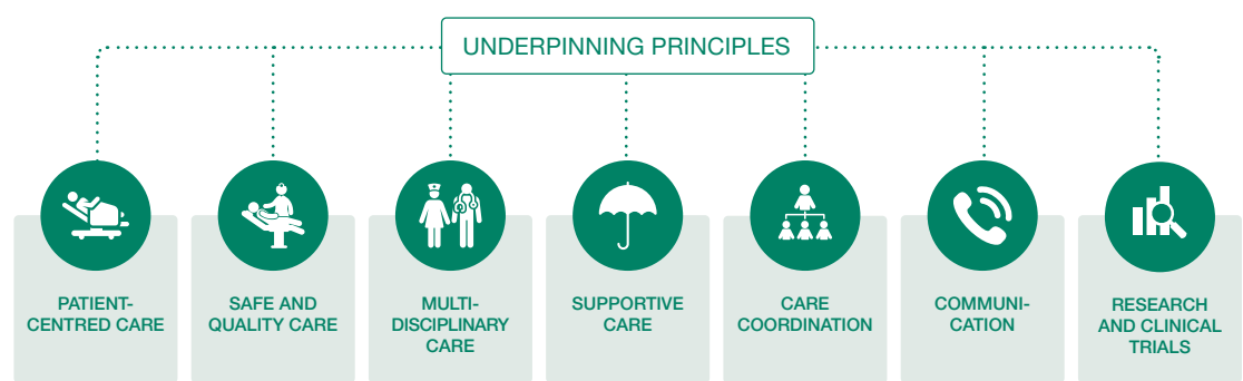
Figure 2: The seven principles underpinning the optimal care pathway

The seven principles of care define appropriate and supportive cancer care that is the right of all patients and the right of those caring for and connected with them.