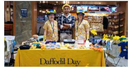
AUGUST 2022 DAFFODIL DAY (Statewide)