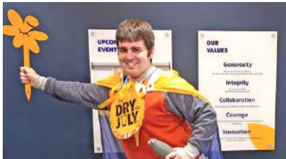
JULY 2022 DRY JULY (Statewide)