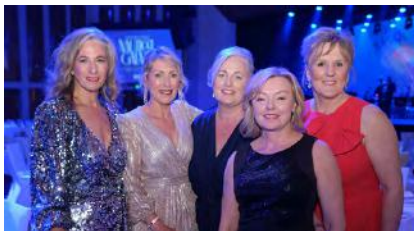
OCTOBER 2022 SPARKLE FOR HOPE GALA BALL (Launceston)