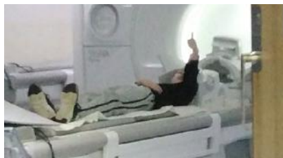
APRIL 2023 TAX APPEAL LAUNCH (Ollie's Story)