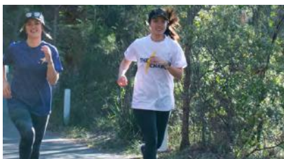
MARCH 2023 THE MARCH CHARGE (Statewide)