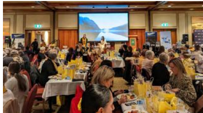
JULY 2022 UNITE IN YELLOW BREAKFAST (Launceston)