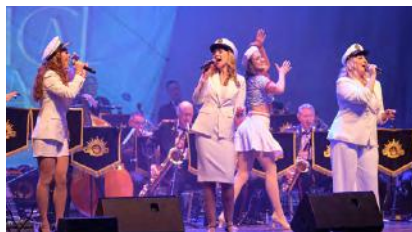
NOVEMBER 2022 NAUTICAL GALA BALL (Hobart)